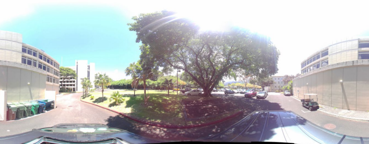
Fig. 1 . (Left) A MCS system with a 360o degree camera mounted on top of a vehicle. (Right) An example panoramic photo captured by the MCS.